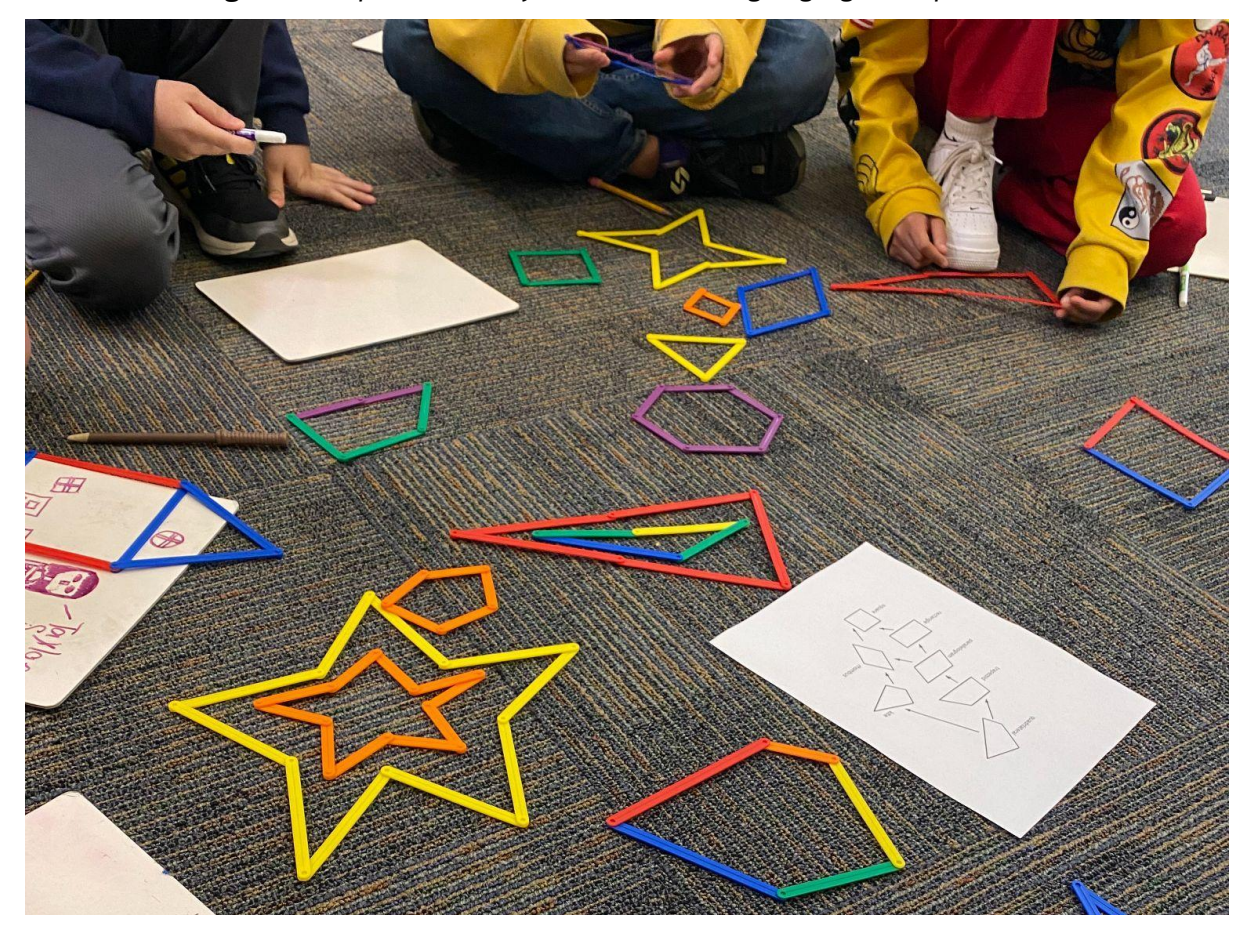
Figure 1: Shapes Created by the Children Using AngLegs manipulatives.

During the sessions focused on teacher observations, we often witnessed the emphasis of procedures and rote memorization of vocabulary tied to highly conceptual topics. We recognized the extreme pressures these teachers were under to prepare and help their students succeed in the annual state assessments, and discussed how these pressures can manifest as teaching focused solely on procedures. As an MTE that focuses on engaging children in problem solving to develop conceptual understanding, I saw this as an opportunity to support the children in making meaningful connections between the procedures and the underlying concepts. I also saw this as a valuable learning opportunity for the PSTs to consider how to navigate these pressures. To supplement the procedures and vocabulary, we decided that during our teaching sessions, we would engage the children in problem solving with opportunities to explore with manipulatives and connect to the procedures.